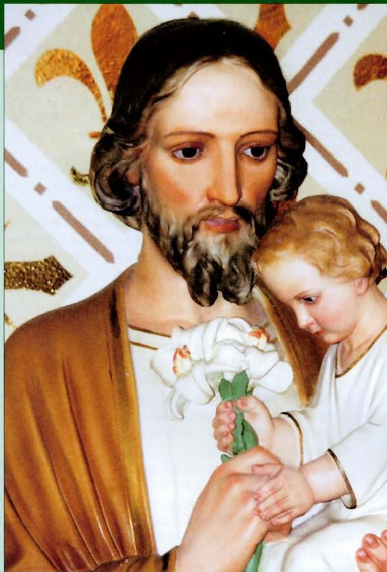
St. Joseph, head of the Holy Family, holds Child Jesus. Both are holding lilies, symbol of purity.

St. Alphonsus wrote: "If the two disciples going to Emmaus were inflamed with Divine love by the few moments which they spent in company with our Savior, and by his words; so much so, that they said, 'Was not our heart burning within us while he spoke in the way?' — what flames of holy love must we not suppose to have been enkindled in the heart of St. Joseph,