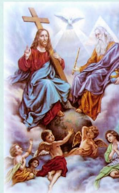
The messages emphasize the indwelling of the Blessed Trinity in the soul and in the Eucharist.

"Then I heard these words: 'Thus should he be honored whom the King desires to honor.'"