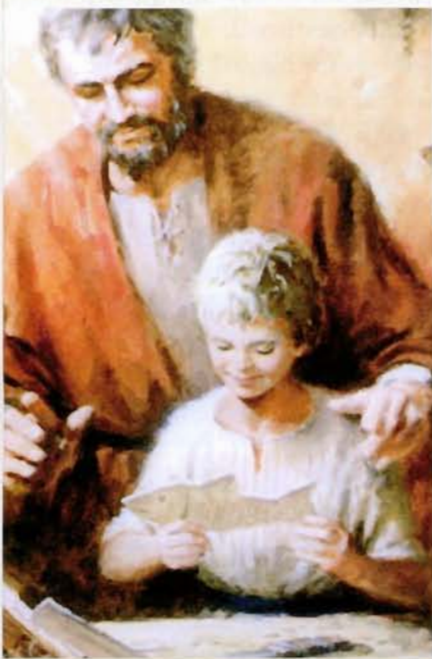
Sanctification of the family is a focus of the messages. Thus St. Joseph has a major role.