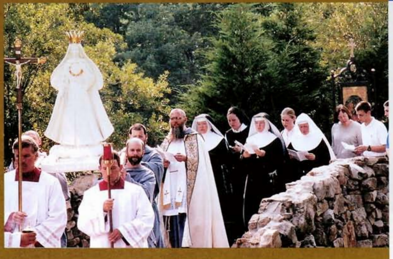
An earlier version statue of Our Lady of America has been at the shrine of the Most Blessed Sacrament, Hanceville, Alabama, the past summer and fall. It was taken in procession at times.

“This is my shrine, my daughter. I am very pleased with it. Tell my children I thank them. Let them finish it quickly and make it a place of pilgrimage. It will be a place of wonders. I promise this. I will bless all those who, either by prayers, labor, or material aid, help to erect this shrine.”