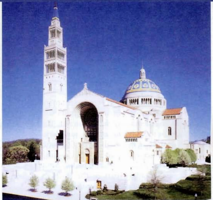
Basilica of the National Shrine of the Immaculate Conception

"What I noticed was the smile on Our Lady's beautiful countenance and the lily she held in her right hand. She wore a white veil reaching almost to the waist and a mantle and robe of pure white with not a single decoration of any kind. An oblong-shaped clasp or brooch held the ends of the mantle together at the top. It was all gold, as was the high and brilliant crown which she wore. Her hair and her eyes seemed of medium brown. Her feet were bare, but these I did not always see, as they were sometimes covered by the moving clouds on which Our Lady stood. She continued to smile. Then I saw her heart appear, encircled with red roses, the symbol of suffering as it was revealed to me, and sending forth flames of fire. With her left hand, Our Lady seemed to be holding up slightly the upper part of her mantle, so that her Immaculate Heart could be seen.